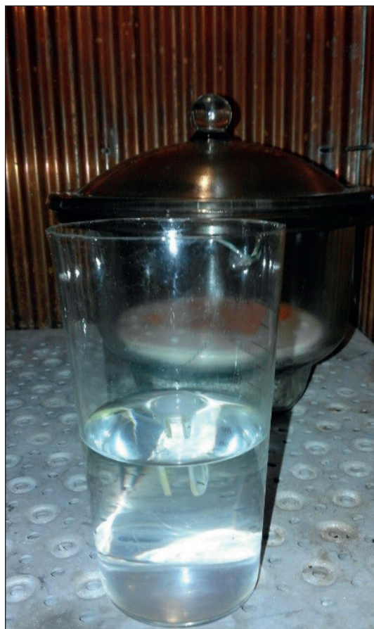
Fig.2. The stage of immersing adhesive plates in distilled water.

alyze the results obtained used micrometer MK-25, №4694, №03 / 5321 from 08/18/17; caliper SC-1, No. 267447, No. 03/5322 from 08/18/17; scales AP 210, №112144137, №87027 / 9 from 24.11.2017