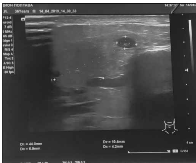
Fig. 2. Sonogram of the left parotid salivary gland (36-year-old patient B.) The main diagnosis: compression-dislocation dysfunction of temporomandibular joint: compression on the left, dislocation of the articular head on the right. Capsule densification is noted in some places. Areas of different echogenicity due to small inclusions, narrowing of large ducts are visualized on the background of a homogeneous structure. Vascularization of the gland is not enhanced. There is the lymph node (6.9 mm x 4.7 mm in size) in the thickness of the gland. Ultrasound signs of mild interstitial sialadenitis.

Ultrasound examination of the parotid glands on the side of the joint with manifestations of compression pain symptom revealed the initial signs of interstitial inflammation. Adjusting the articular heads in the correct anatomical position, therapeutic exercises for the musculo-articular complex, the use of a repositioning rubber plate on the chewing teeth